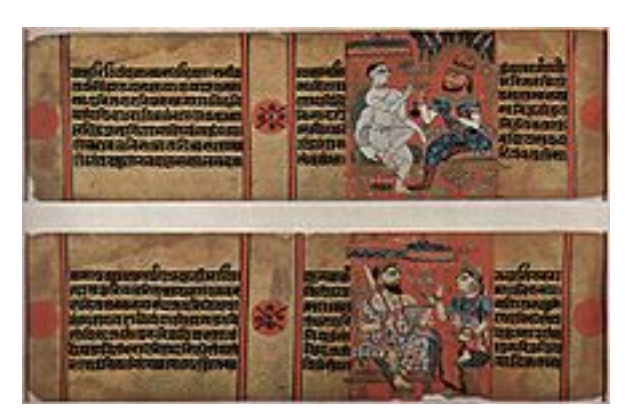
White-clothed Acharya Kalaka

Other austerities include meditation in seated or standing posture near river banks in the cold wind or meditation atop hills and mountains, especially at noon when the sun is at its fiercest. Such austerities are undertaken according to the physical and mental limits of the individual ascetic. Jain ascetics are (almost) completely without possessions. Some Jains (Shvetambara monks and nuns) own only unstitched white robes (an upper and lower garment) and a bowl used for eating and collecting alms. Male Digambara monks do not wear any clothes and carry nothing with them except a soft broom made of shed peacock feathers ( pinchi ) and eat from their hands. They sleep on the floor without blankets and sit on special wooden platforms.